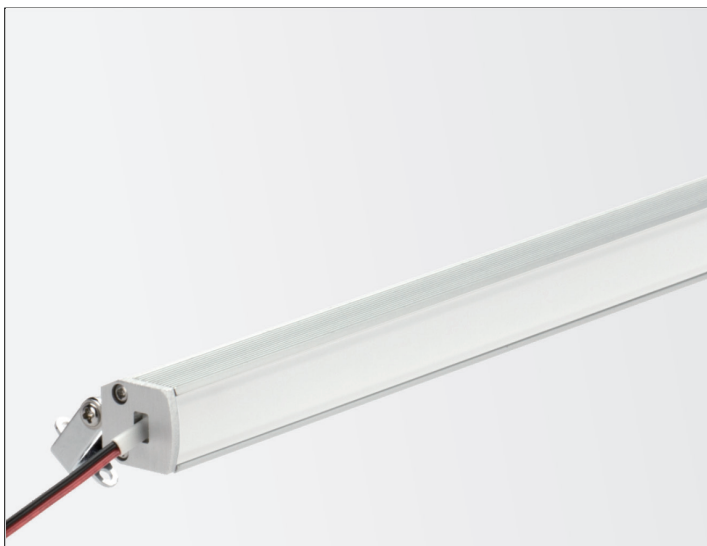
Shown with P02C-S-PF-300 profile with P02C-A-OB bracket and P02C-A-EC end cap.