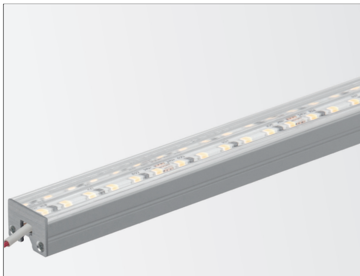
Shown with P01C-S-PF-300 profile and P01C-A-EC end cap.