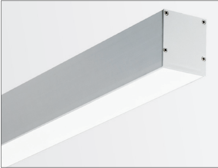
DLE5570 profile shown in aluminum finish with opal lens and end cap.